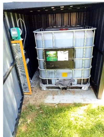
1000ltr IBC and Metering Pump.